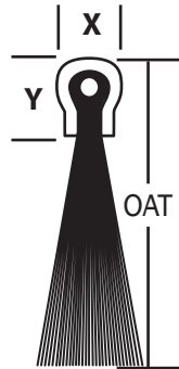
Overall Trim (OAT)